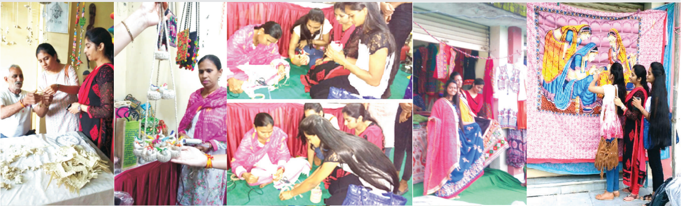
Demo of Art & Craft at Craft exhibition, Urban Haat Bazaar : Instructed by local artist